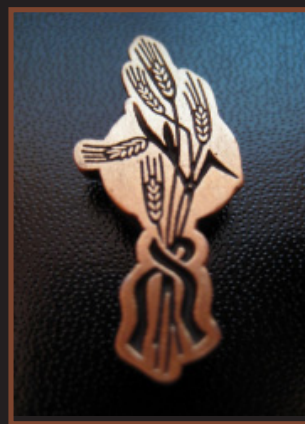
Commemorative Pin designed by Oleh Lesiuk