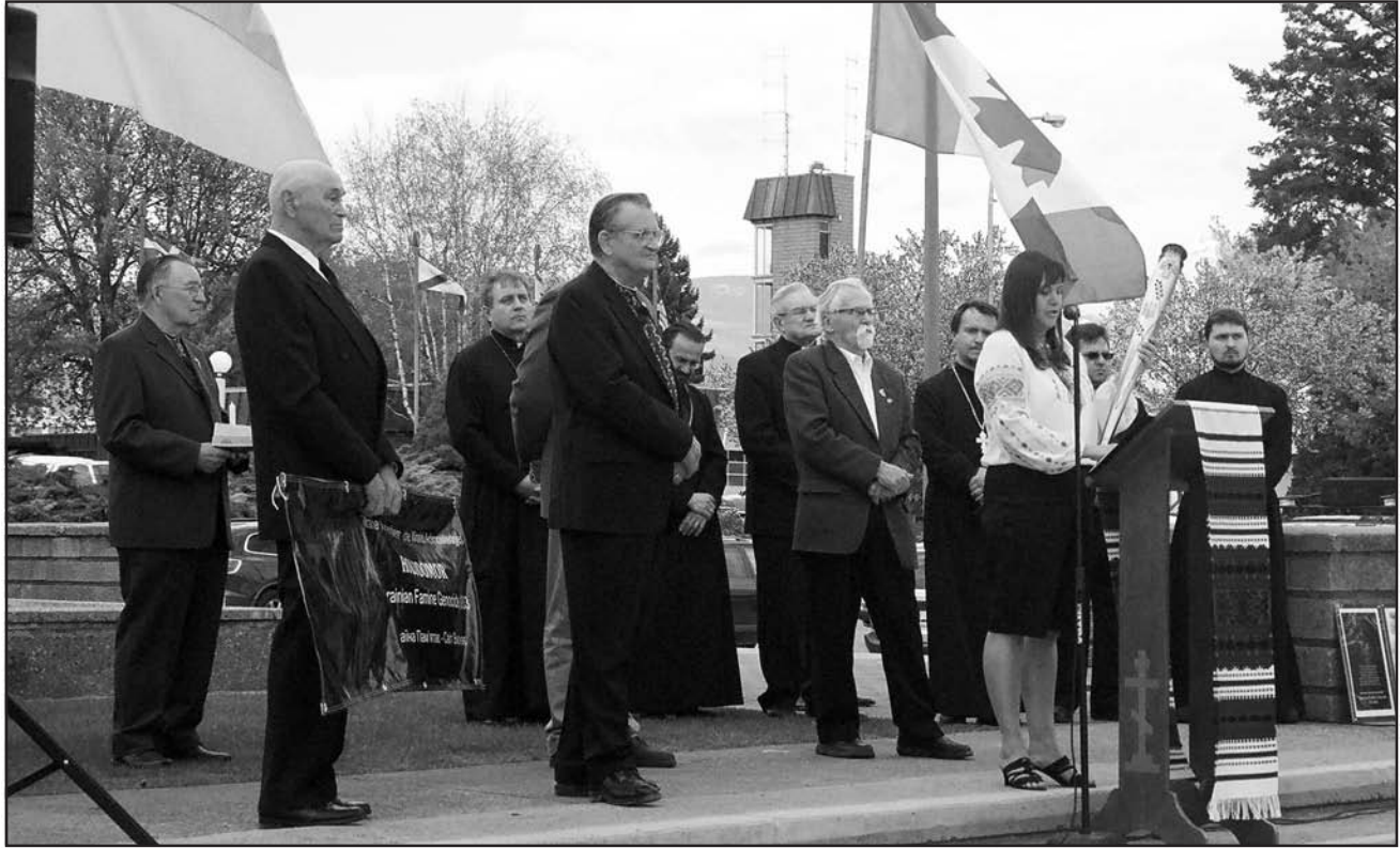
Youth representative speaks during the Vernon ceremony.