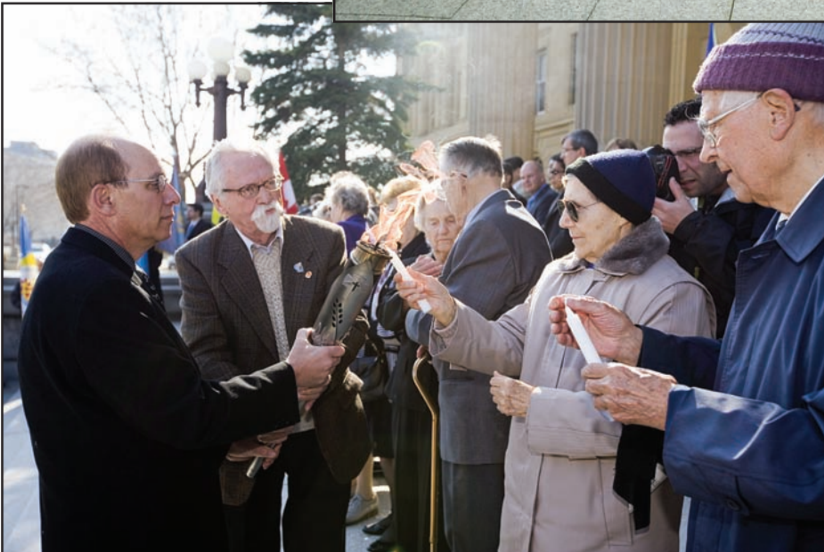
Edmonton Mayor Stephen Mandel lights the candles of Holodomor survivors at the Alberta Legislature.