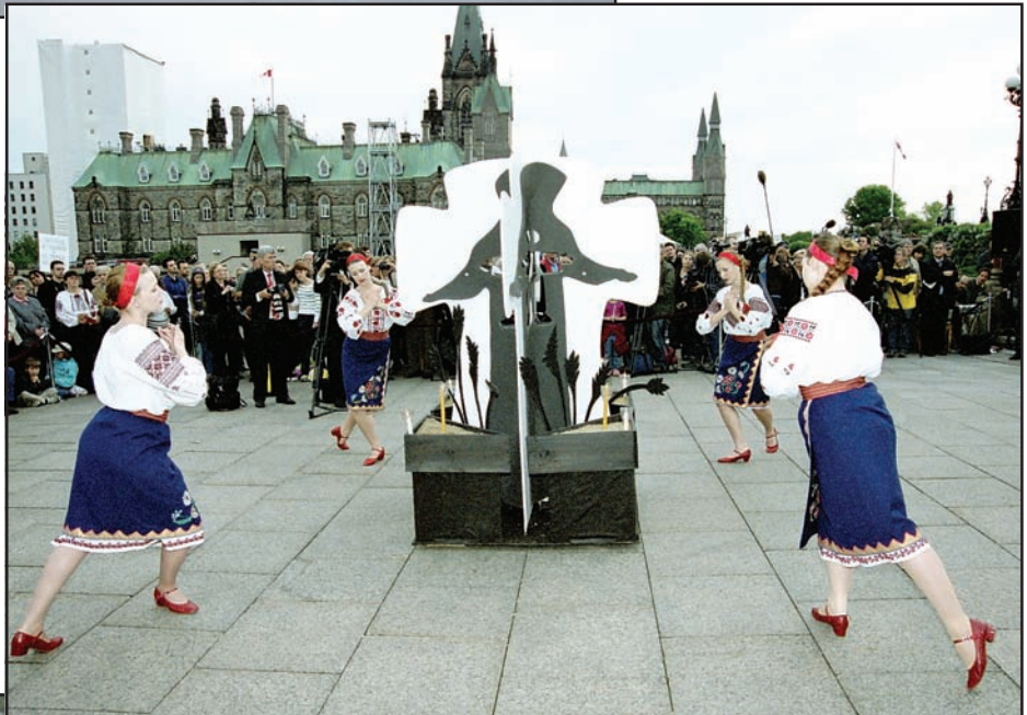
Members of the "Svitanok" dance group perform at the Holodomor Monument replica on Parliament Hill in Ottawa,